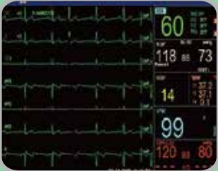
3/5-lead ECG Analysis