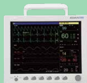
iM8 VET series Veterinary Monitor